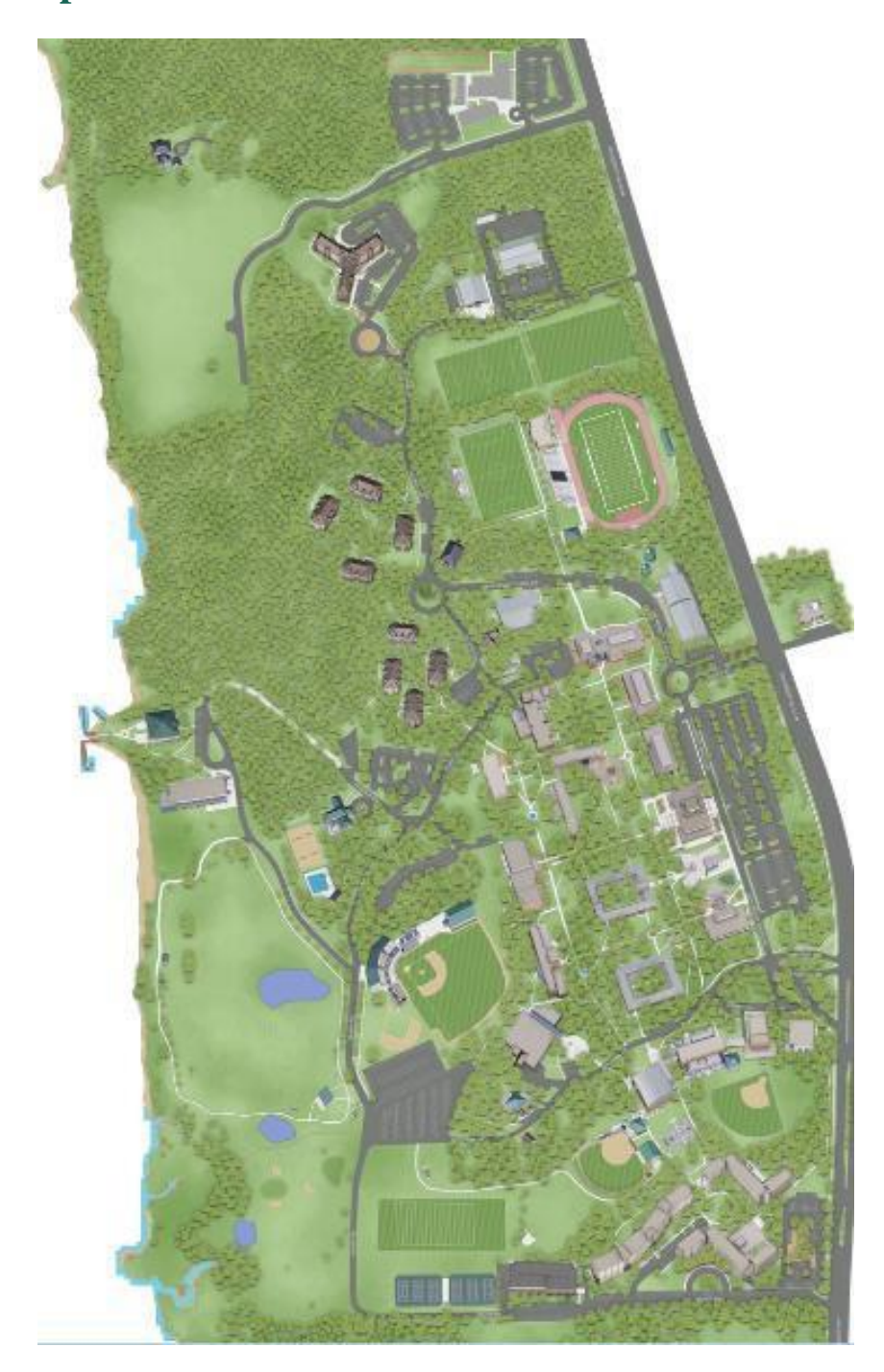
The Jacksonville University main campus is located at 2800 University Boulevard North, Jacksonville, FL 32211. An interactive map of campus is available at <u>ju.edu/map</u>.